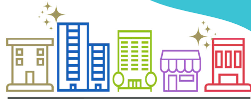
Business Improvement Grant Program